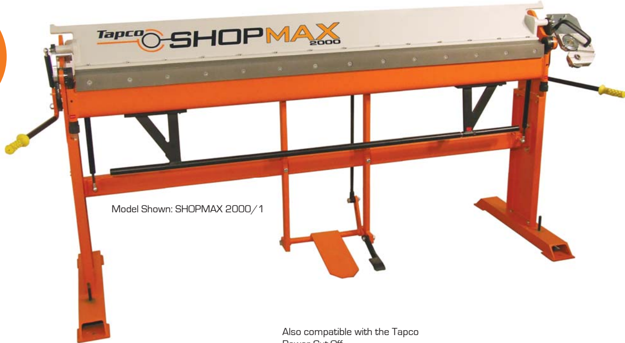
Model Shown: SHOPMAX 2000/1

Also compatible with the Tapco Power Cut-Off