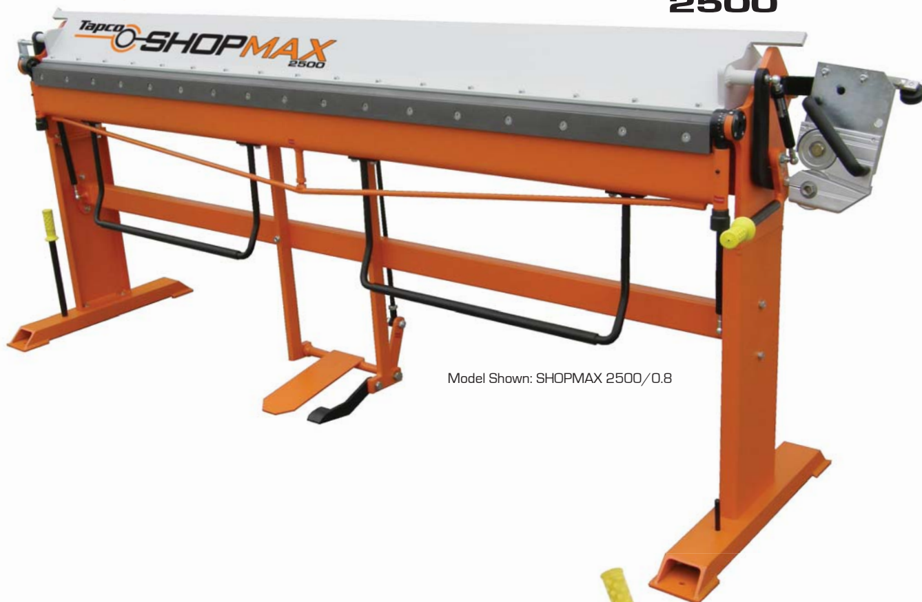
Model Shown: SHOPMAX 2500/0.8